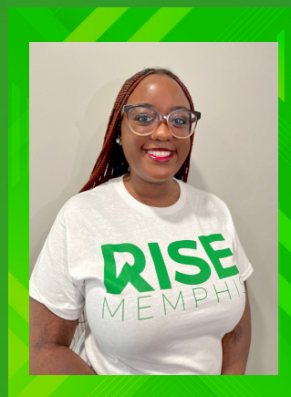
CHARITY CURRY PROGRAM COORDINATOR FOR SAVE UP